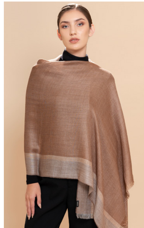
XXC0005 - Brown & Grey