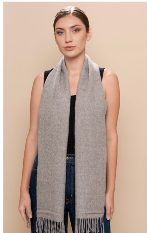
09A0124 - Mid Grey