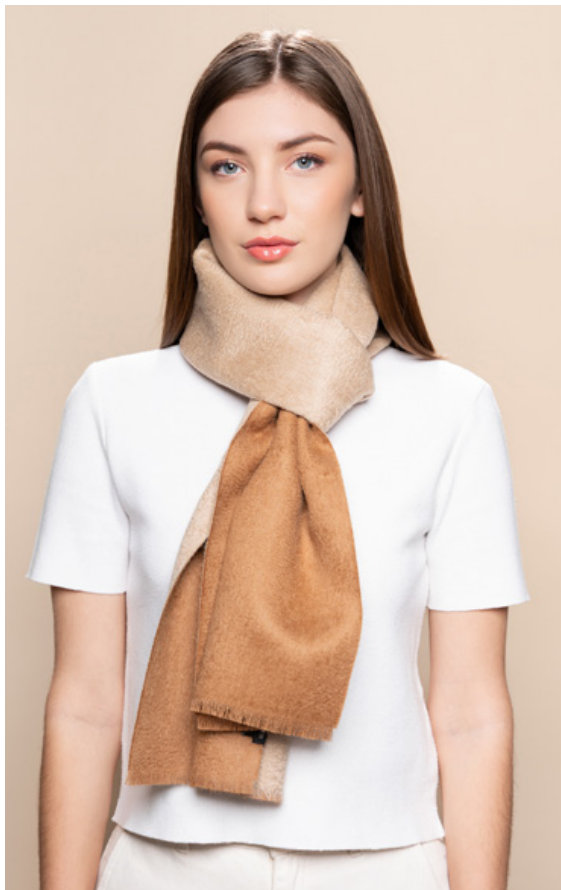
XXC0038 - Beige & Camel