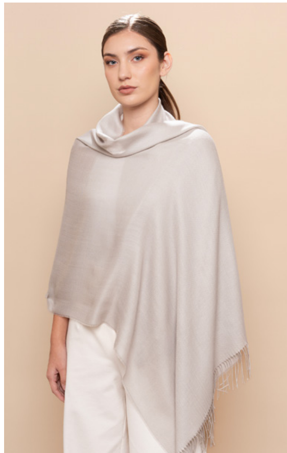
H960052 - Silver