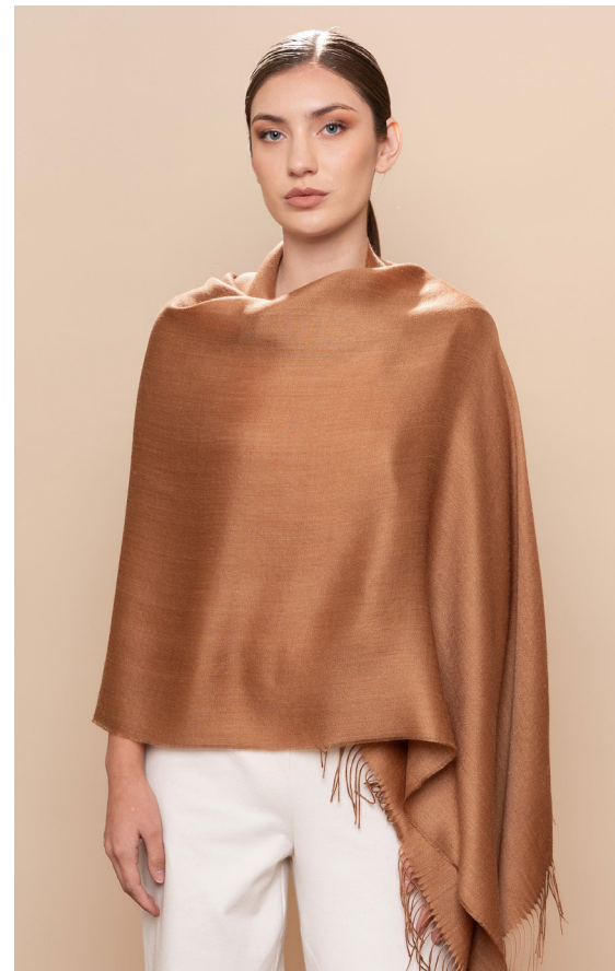
H830001 - Camel