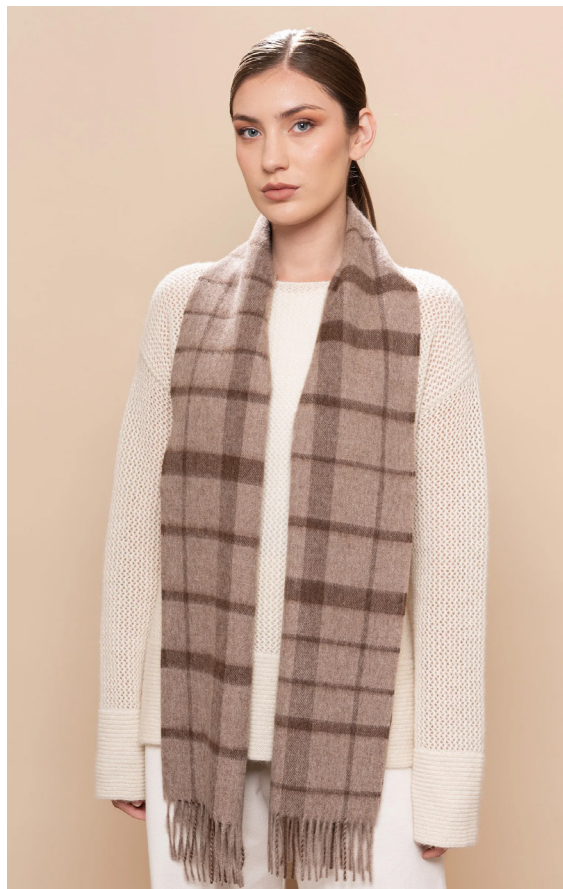
XXC0003 - Cinnamon & Brown