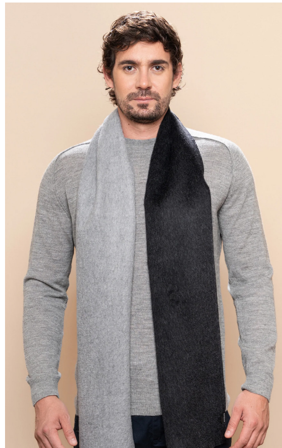
XXC0040 - Black & Mid Grey