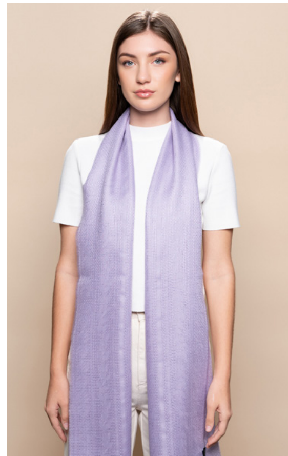
XXC0007 - Lavender