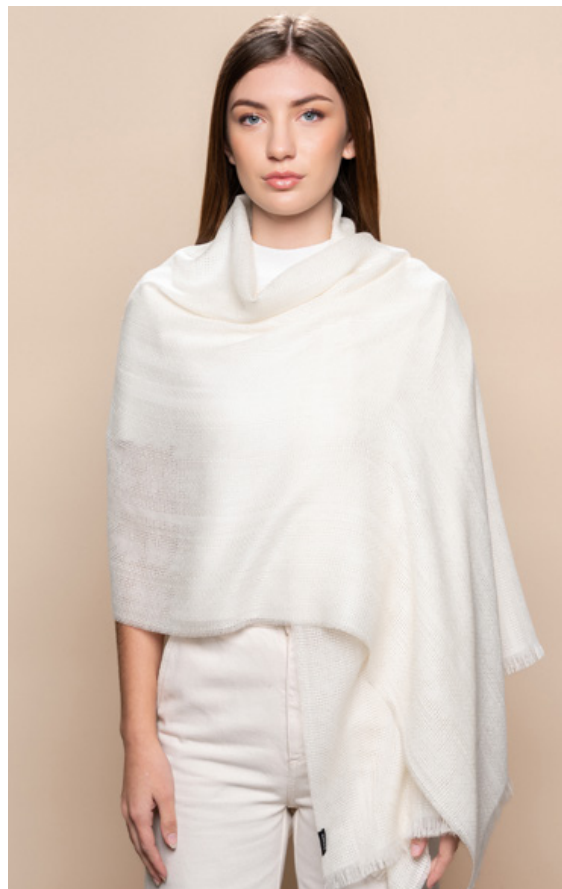
XXC0005 - White