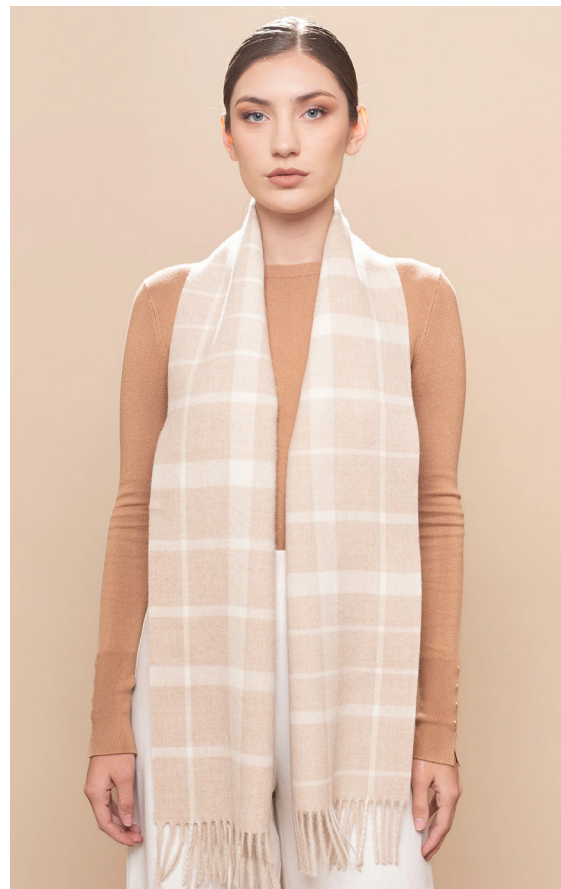
XXC0005 - Beige/White