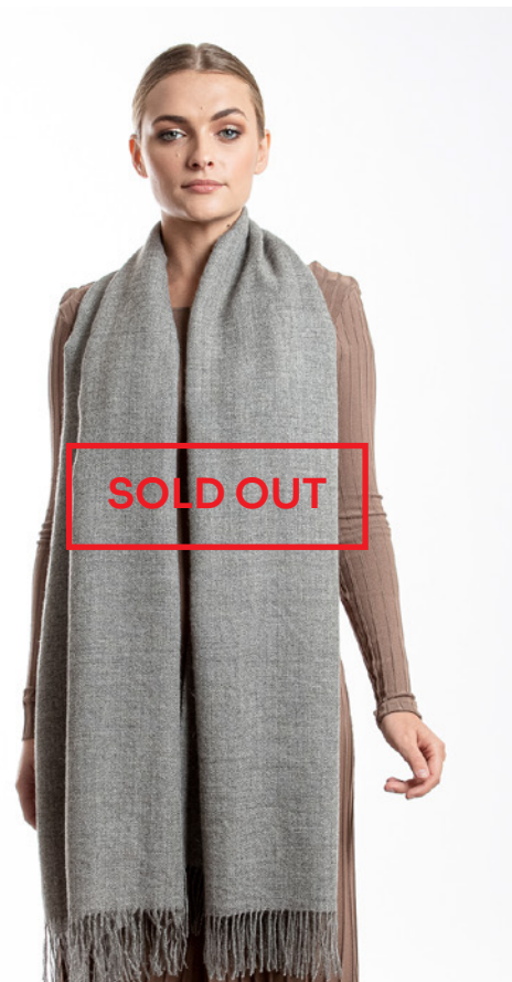
09A0124 - Mid Grey