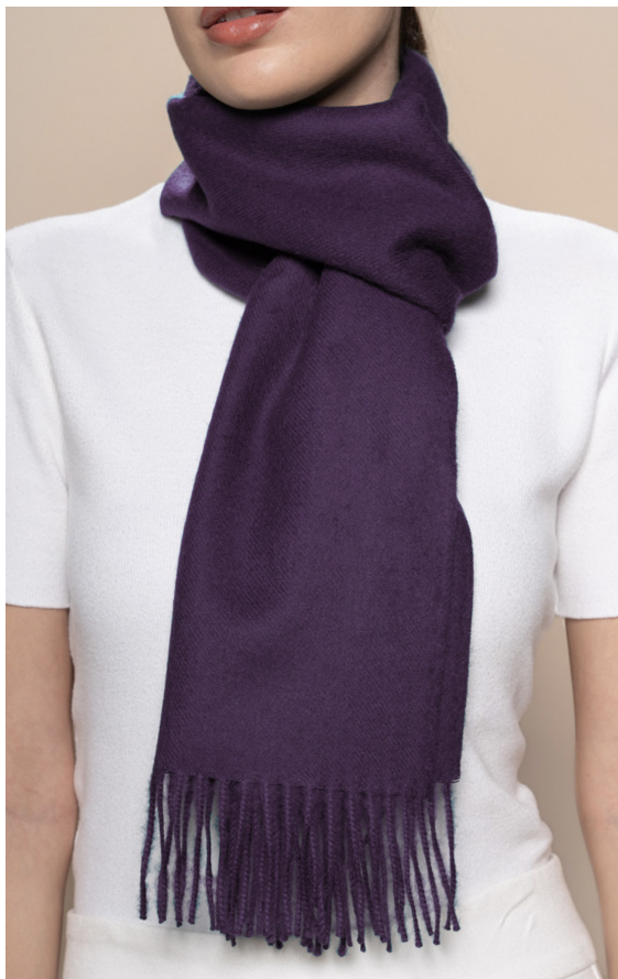
P730041 - Purple