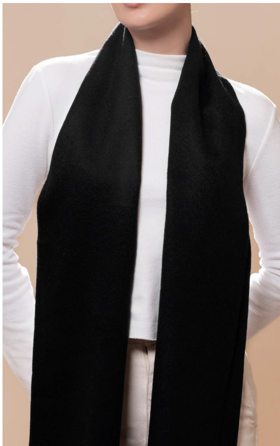
P910001 - Black