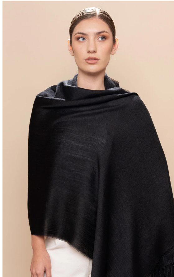
H910001 - Black