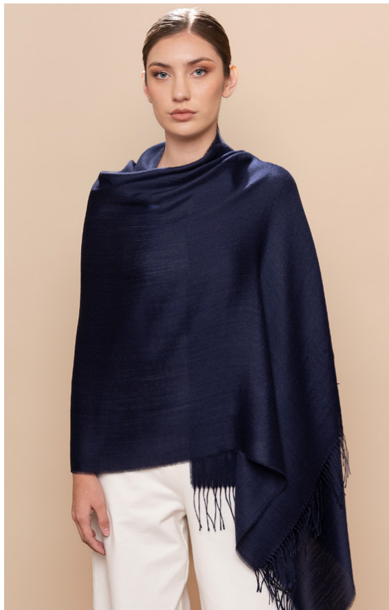
H510137 - Navy Blue