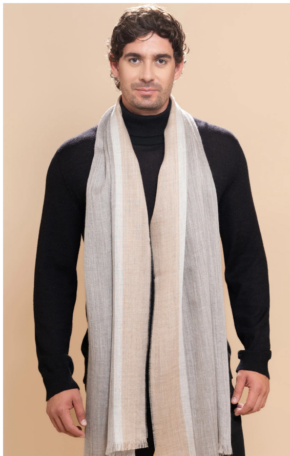
XXC0001 - Mid Grey/Beige