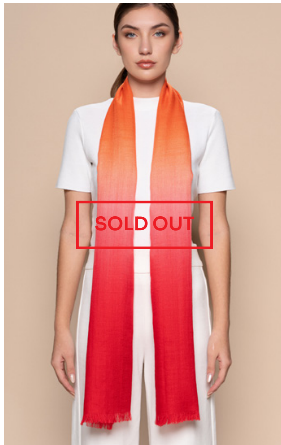
XTA0004 - Orange & Red