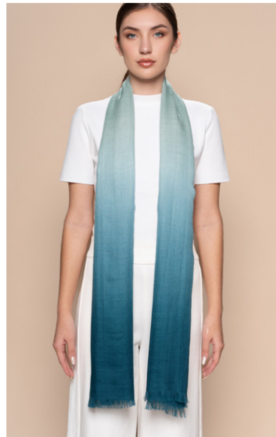
XTA0003 - Aquamarine & Jade Green