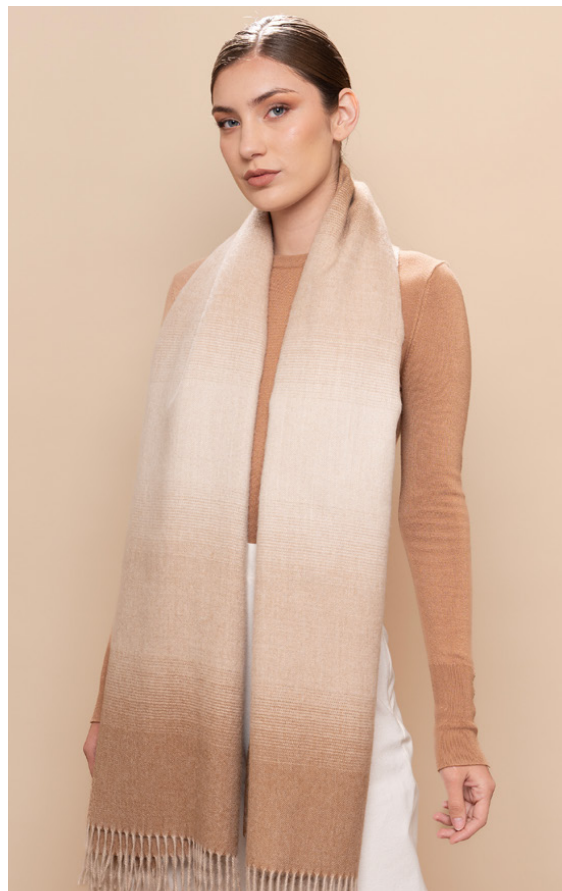
XXC0002 - Beige & Camel