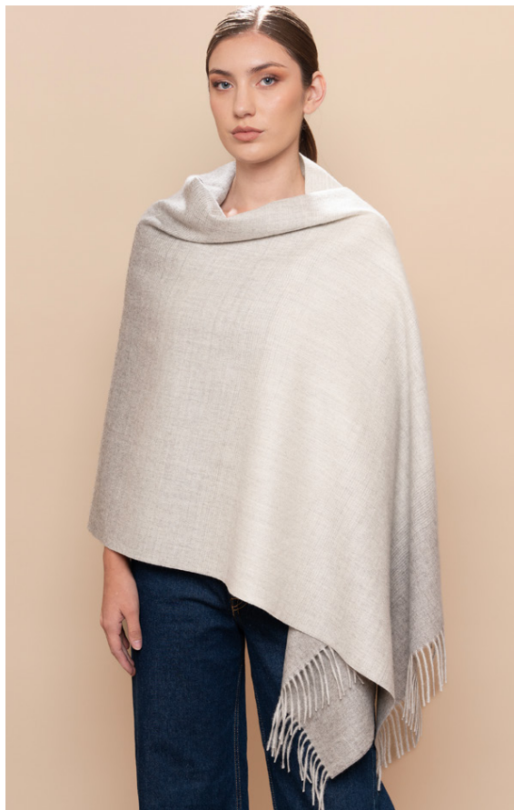
XXC0001- Light Grey & Mid Grey