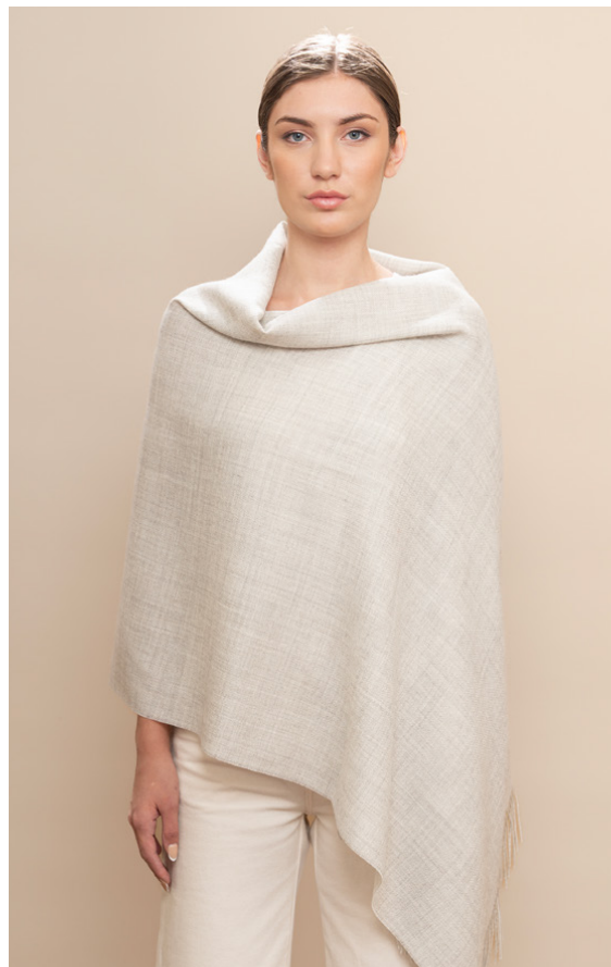
09A00053 - Light Grey