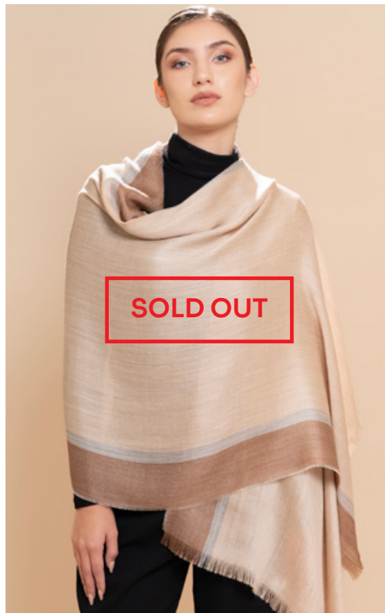
XXC0003 - Beige & Camel