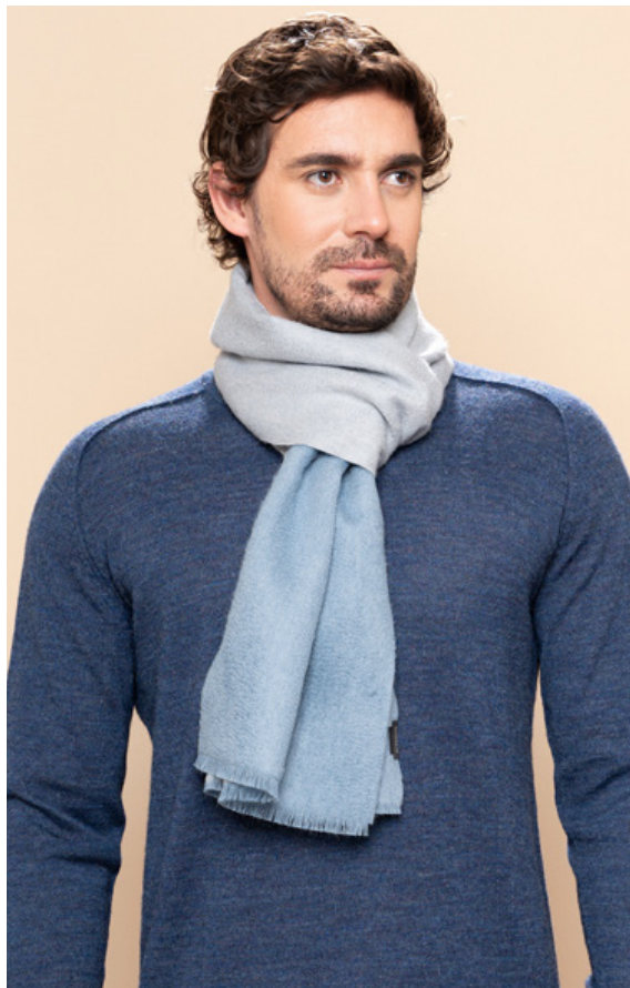
XXC0036 - Steel & Light Blue-Gray

Reversible bicolor Suri scarf with frayed edges