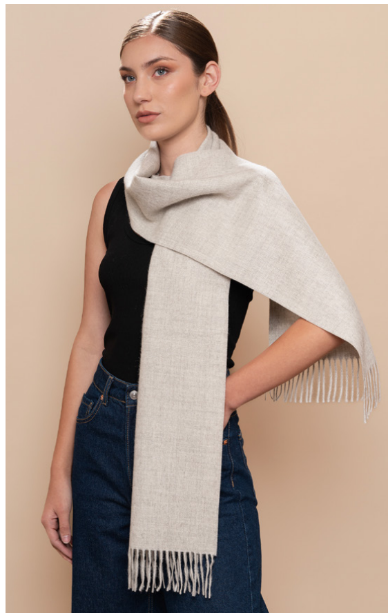
09A0053 - Light Grey