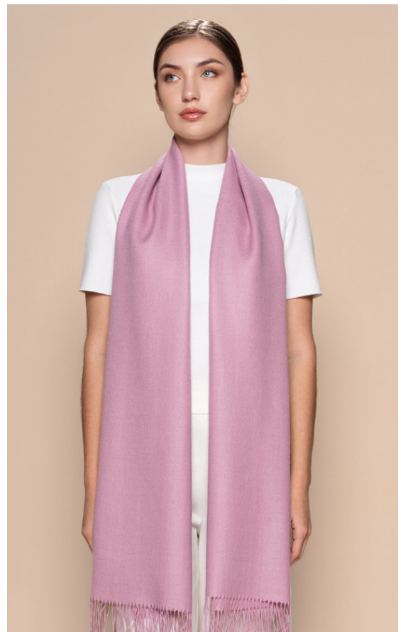
H150083 - Light Mauve