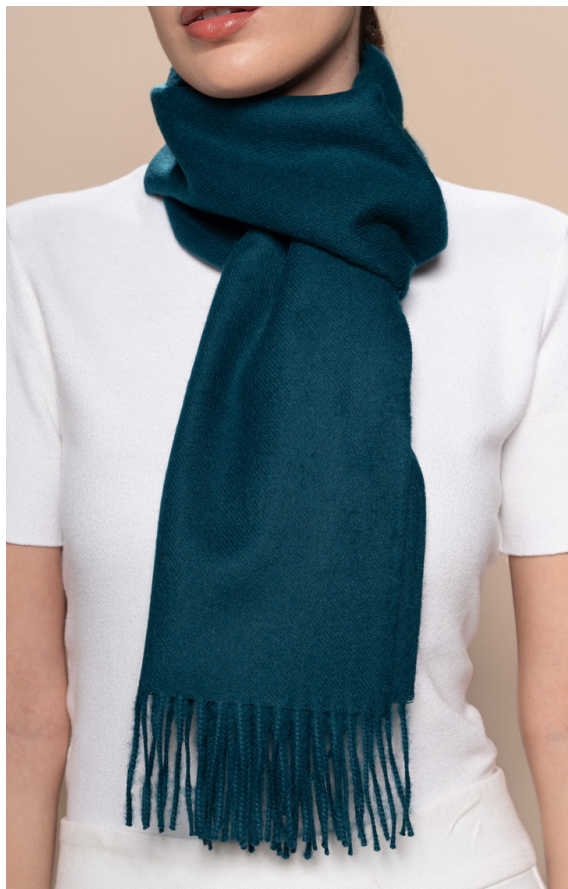
P420040 - Jade Green