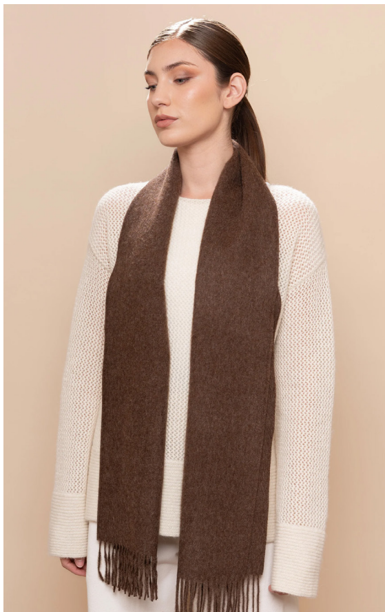
08A0409 - Brown