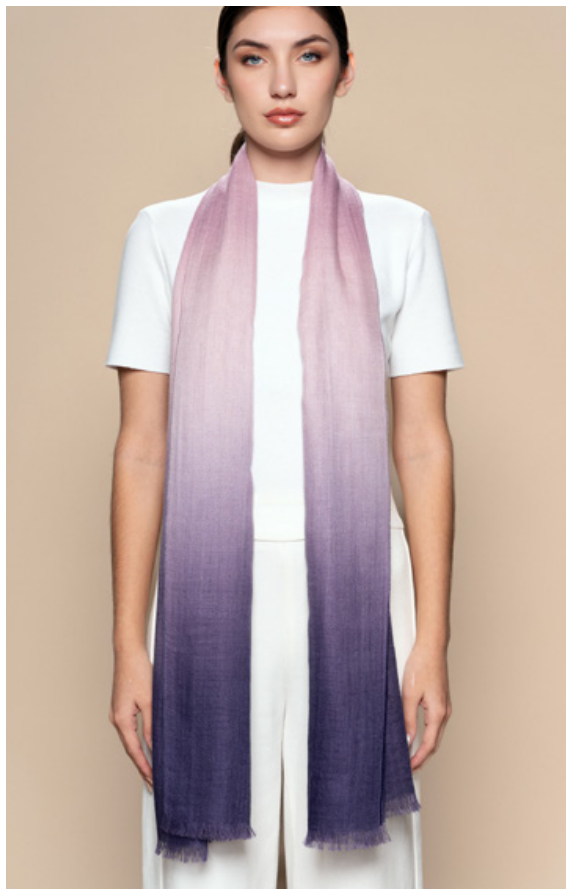
XTA0002 - Lavender & Purple

Lightweight ombre hand dyed shawl with frayed edges