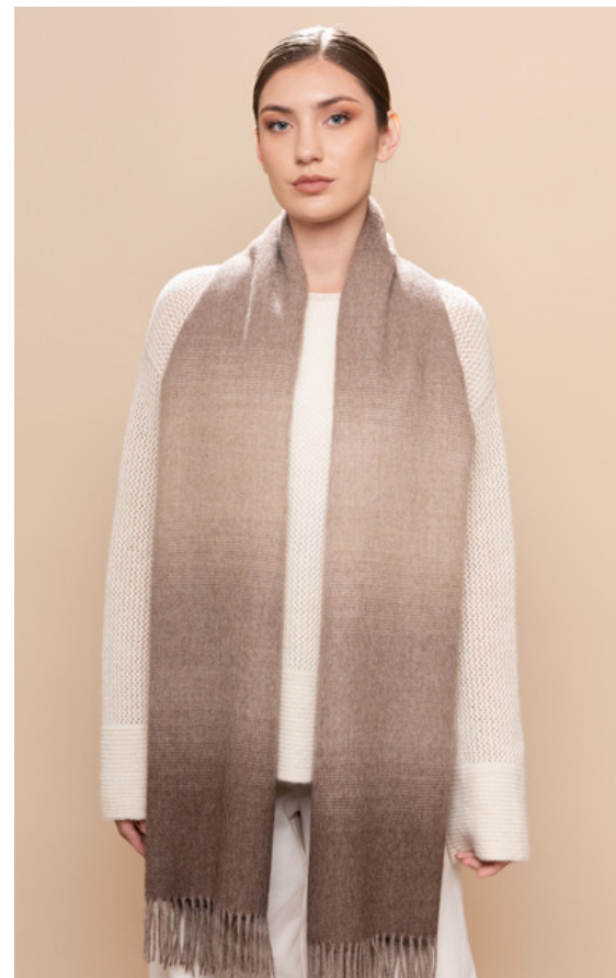
XXC0003 - Cinnamon & Brown