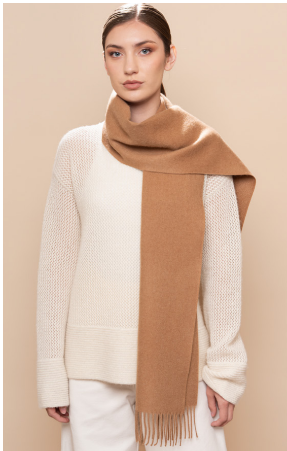
0840001 - Camel