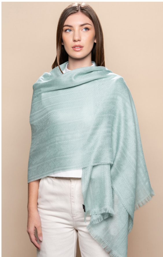
XXC0004 - Mint

Traforatto jacquard shawl with frayed edges