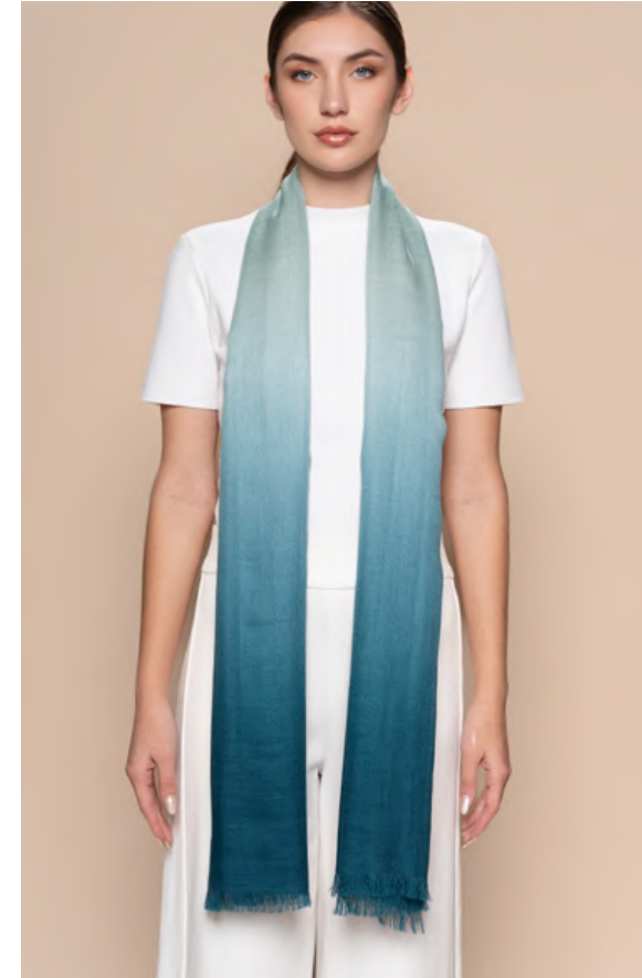
XTA0003 - AQUAMARINE & JADE GREEN