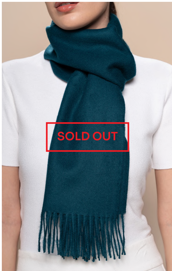
P420040 - JADE GREEN