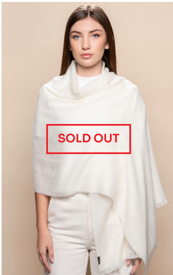
XXC0005 - WHITE