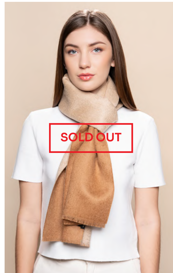
XXC0038 - BEIGE & CAMEL