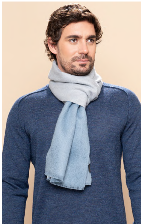
XXC0036 - STEEL & LIGHT BLUE-GRAY