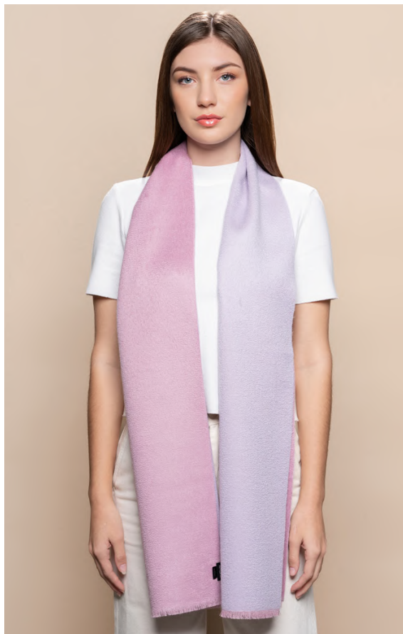
XXC0039 - SOFT PINK & LIGHT PURPLE

Reversible bicolor Suri scarf with frayed edges