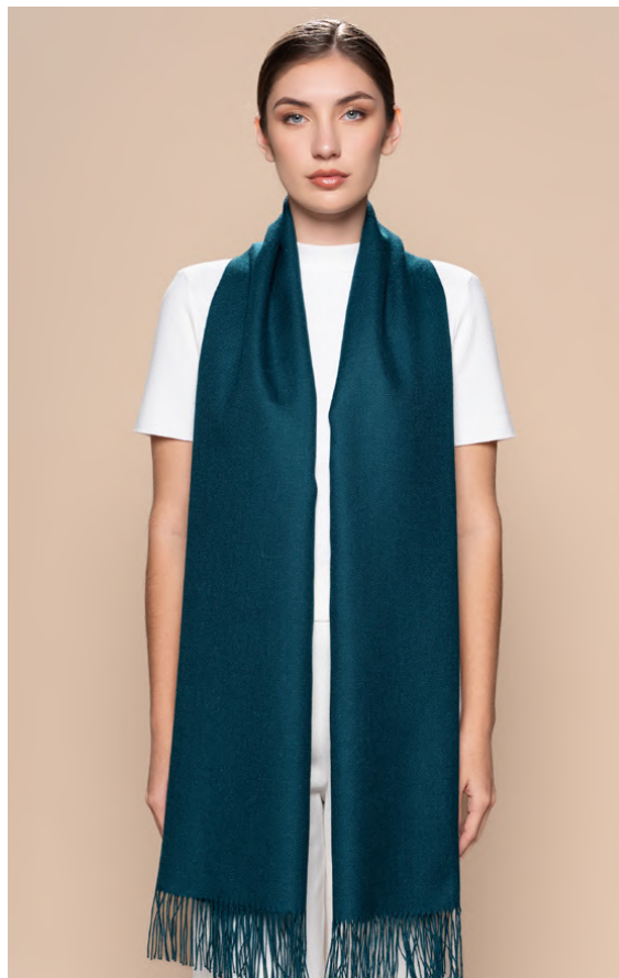
H420040 - JADE GREEN