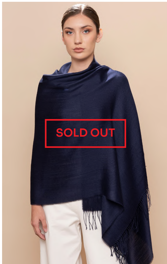
H510137 - NAVY BLUE