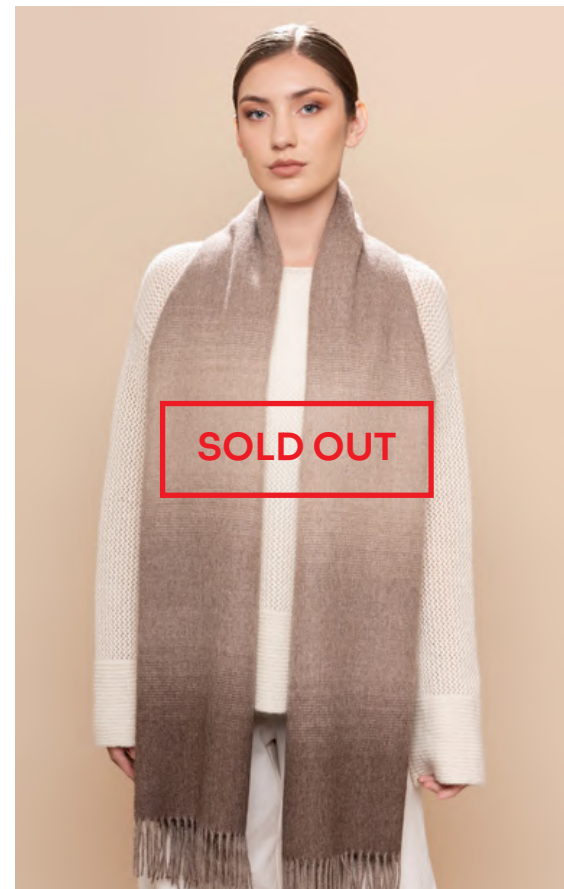
XXC0003 - CINNAMON & BROWN