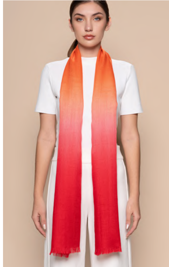
XTA0004 - ORANGE & RED