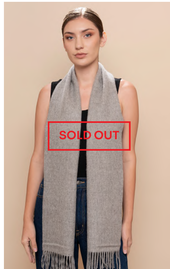
09A0124 - MID GREY