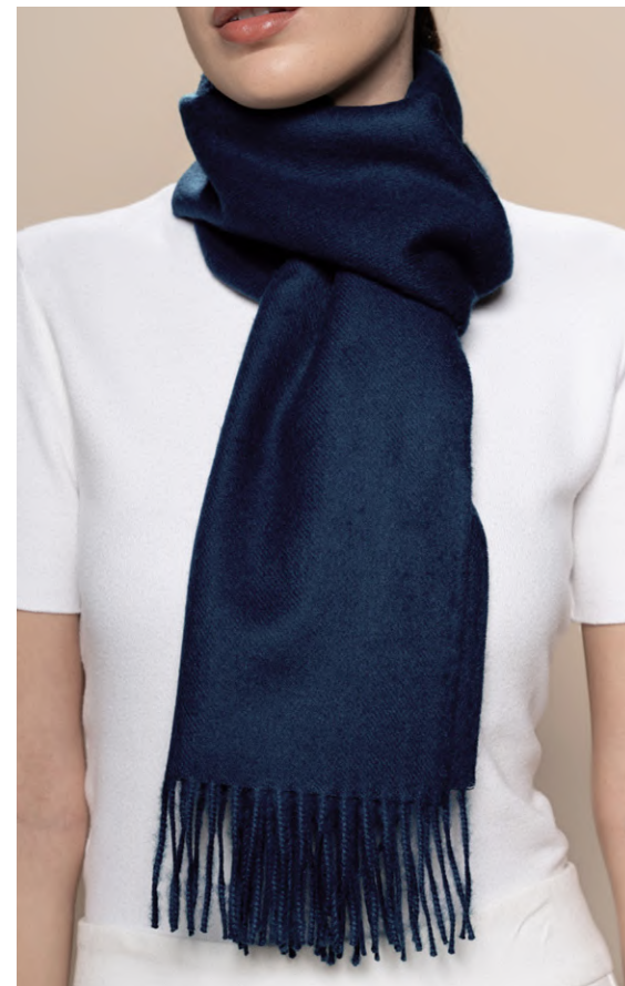
P510137 - NAVY BLUE