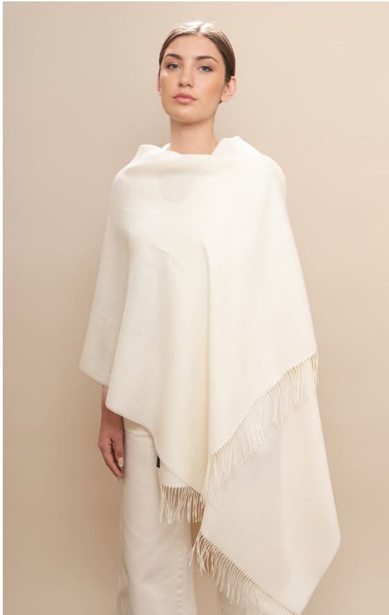
M080006 - IVORY