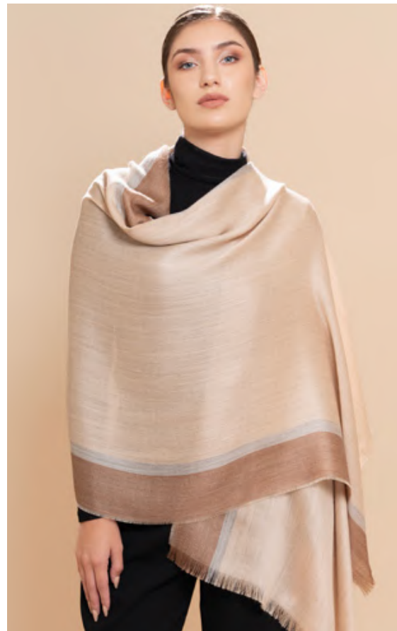
XXC0003 - BEIGE & CAMEL